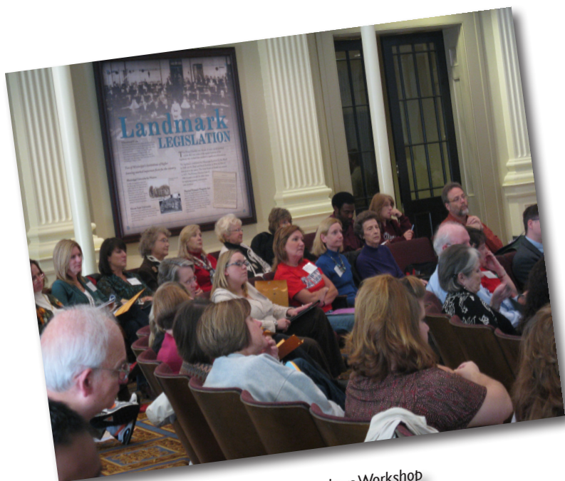
Social Studies Teachers Workshop