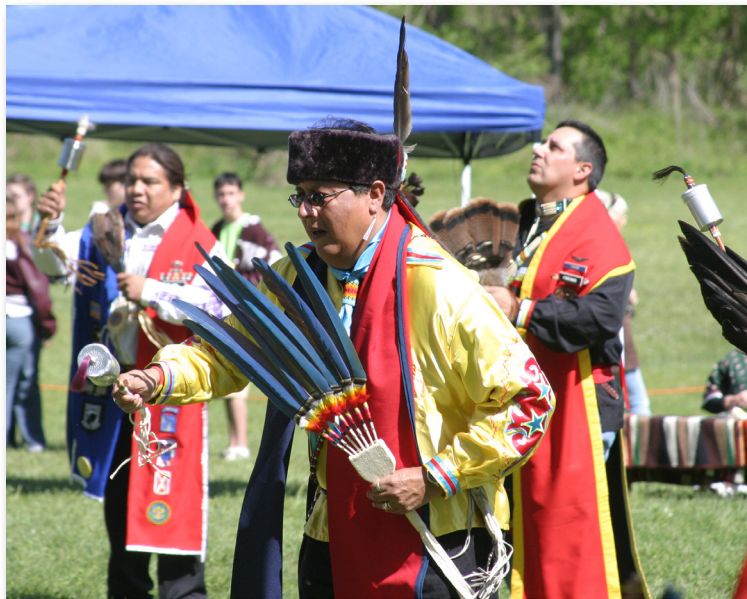
Natchez Powwow held at Grand Village of The Natchez Indians

Traditional Native American dancing, singing and fun came to the Grand Village of the Natchez Indians for the 23rd Annual Natchez Powwow on Saturday, March 26, and Sunday, March 27, 2011. The Powwow has become a tradition in Mississippi and Louisiana, linking modern society with the area's past cultures and the rich legacy of the Natchez Indians.