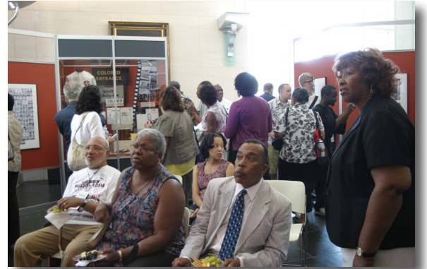
Freedom Riders 50th Reunion

returned to Mississippi to commemorate that anniversary in May of 2011. MDAH took part in the celebration through the Freedom Riders Digital Collaborative, the special exhibit “The Freedom Rides: Journey for Change,” and the recording project “Speak Now: Memories of the Civil Rights Era.”