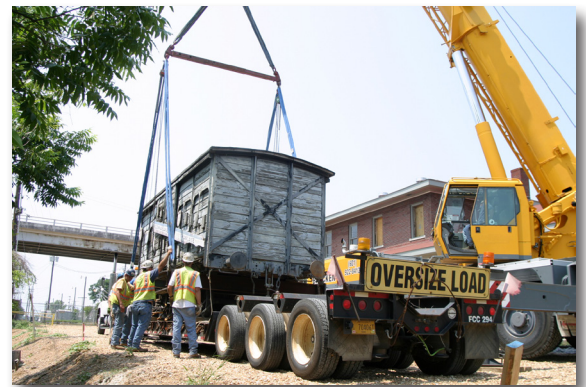
French Merci boxcar being moved for restoration

The Museum Division has occupied temporary office space beside the new farmer's market on High Street since 2005, when damage from Hurricane Katrina forced them out of the Old Capitol Museum. The GM&O Depot sits between the Charlotte Capers Archives and History Building and the Naval Reserve Building. It was constructed for the New