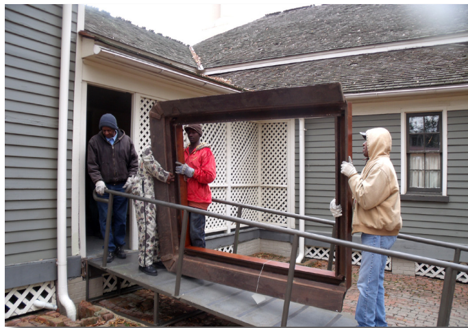
Manship House Museum Closed For Repairs

Since the site closed, staff offices and the extensive collection of Manship family furniture and artifacts have been packed and moved off site in order for the repairs to begin. Manship House staff were reassigned to other sites during repairs. The project will be a major step in the preservation of the building and will also be an excellent opportunity for staff to evaluate the collection and improve interpretation of the site.