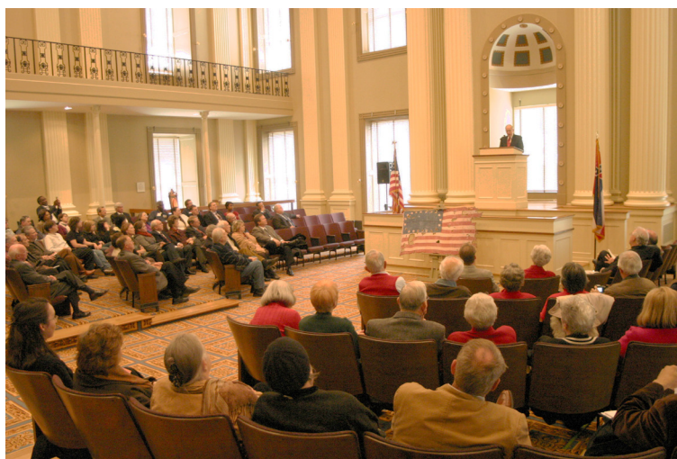
2nd Annual Statehood Day

The ordinance of secession was drafted on Monday, January 7, 1861 and by Wednesday, January 9, Mississippi's fate was decided when the ordinance passed with an eighty-four-to-fifteen vote. By February Mississippi had joined the newly formed Confederate States of America and was preparing for war.