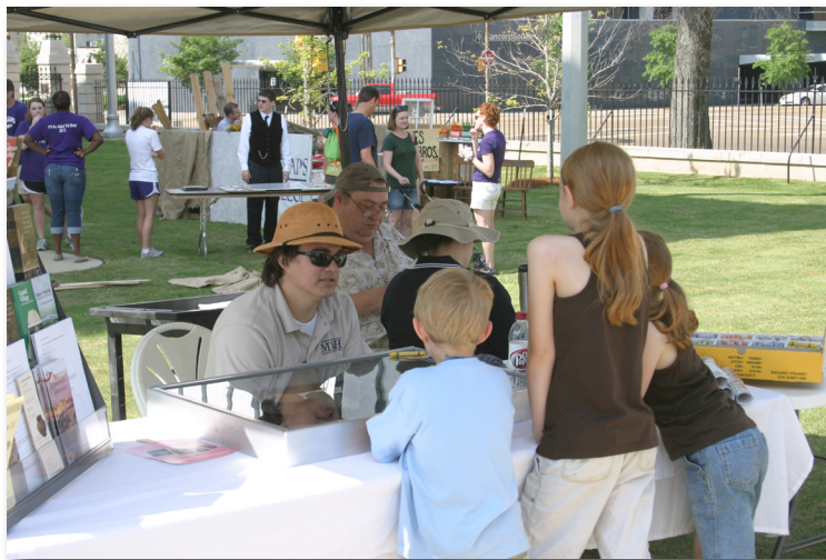
Gathering on the Green at Old Capitol Museum

The completion of the project coincides with the Civil War Sesquicentennial which will be observed through 2014.