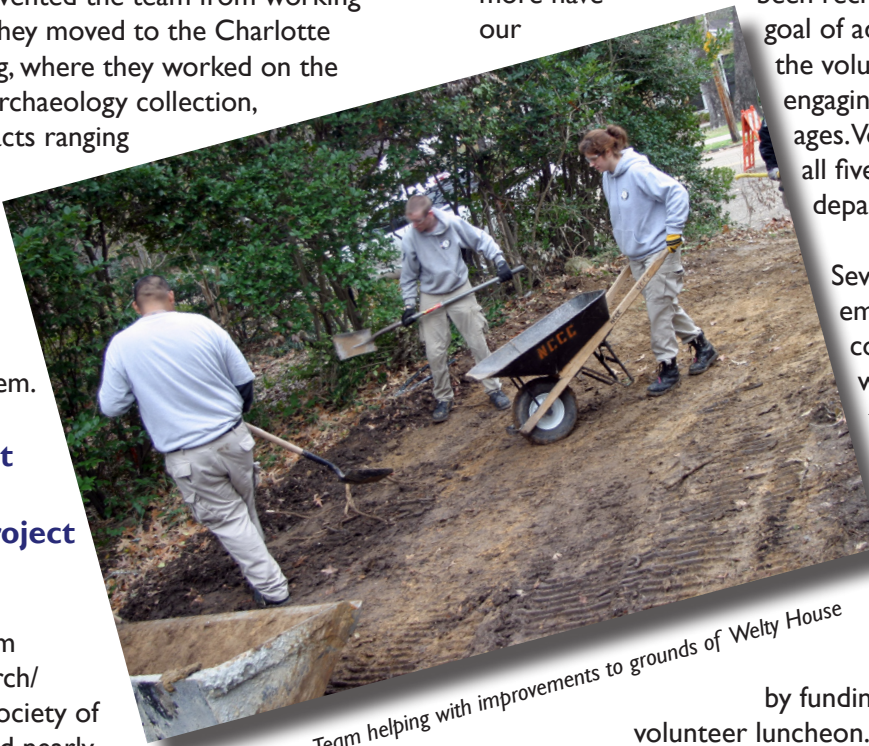
AmeriCorps Team helping with improvements to grounds of Welty House

Several MDAH employees have conducted workshops and tours exclusively for volunteers as a "thank you" and the Foundation for Mississippi History has been supportive by funding the annual volunteer luncheon. MDAH volunteers also received an Award of Merit from the Mississippi Historical Society.