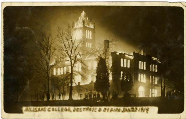
Millsaps College Burning

nearly 1,000 images, primarily of Crystal Springs and Copiah County, from around 1900 to the 1940s