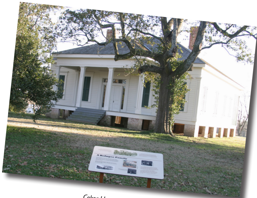
Coker House, Hinds County

The maximum grant any project may receive is $210,000. Recipients must provide a twenty percent match of either cash or in-kind contributions. Grant funds will be provided on a reimbursable basis once all work is completed and approved by MDAH.