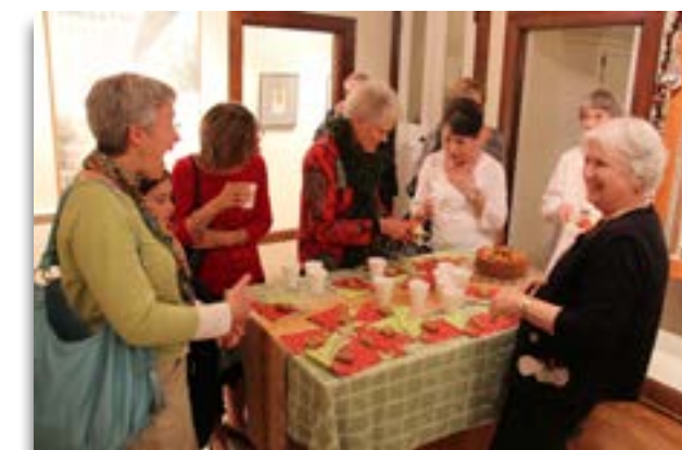
Visitors at the Eudora Welty House sample fruitcake made using the Welty family recipe.

The Old Capitol, Jackson's oldest building, was decked with greenery in the style used in 1840 when local women prepared the building for a visit by Andrew Jackson. Garlands hung around the rotunda railing on the second floor and the stairwells, and wreaths decorated the exterior of the building. The circa-1841 Mississippi Governor's Mansion was decorated with seasonal greenery.