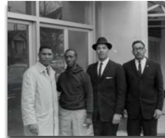
Medgar Evers, at left, with three men in March 1963.

In observance of the fiftieth anniversary of his death, MDAH commemorated the life of civil rights leader Medgar Evers with exhibits and programs. Evers was the Mississippi field secretary for the NAACP from 1954 until his assassination in the driveway of his family's home in Jackson on June 11, 1963. On May 1, 2013 a History Is Lunch lecture by Myrlie Evers, former chair of the NAACP and Medgar Evers's widow, opened the exhibit "This Is Home": Medgar Evers, Mississippi, and the Movement . Drawing on photographs, artifacts, documents, and newsfilm footage from the MDAH collection, the exhibit covered Evers's early life and family, his career with the NAACP, and his death. The exhibit will run through October 2013 at the William F. Winter Archives and History Building in Jackson, then travel the state.