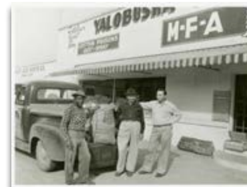
Yalobusha Co. Co-op, 1956, Water Valley, Mississippi. From Series II of the Mississippi Farm Bureau Federation Collection.

The Farm Bureau Collection provides a unique overview of Mississippi farm practices and land use from the late nineteenth- through the early twenty-first centuries, as well as the effects of natural disasters on agriculture; health and safety issues