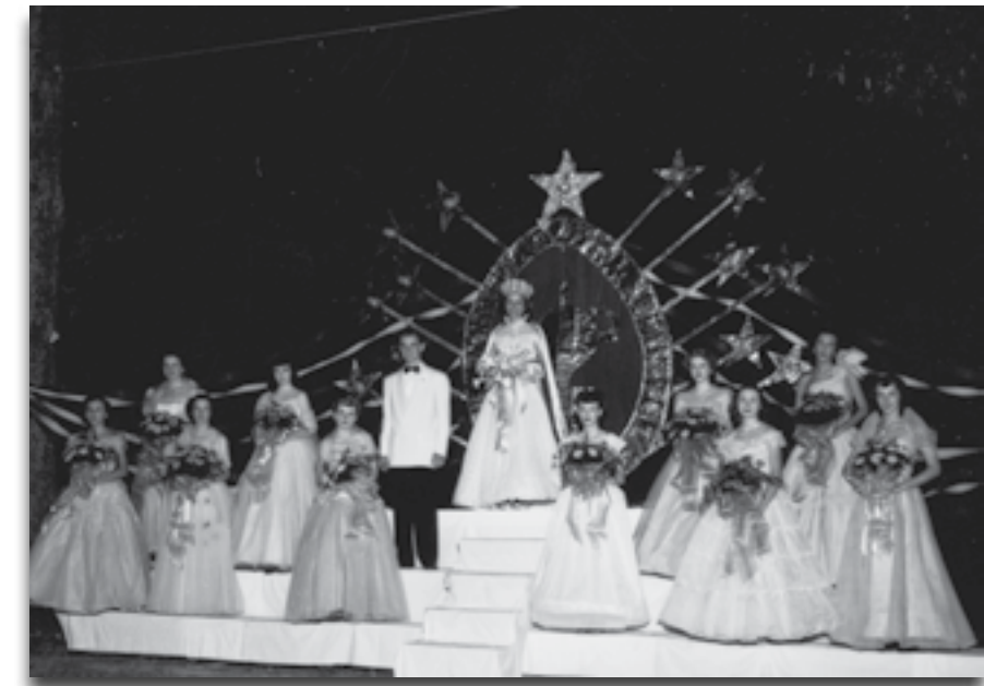
Whitworth College, Coronation Pageant, May 29, 1950. Queen stands atop decorated platform.

More than 3,700 photographs highlighting the state's rural and agricultural heritage have been added to the department's Web site. The Mississippi Farm Bureau Federation Collection and C.W. Witbeck Collection can now be viewed online through the MDAH Digital Archives. These photographs offer glimpses into everyday small-town life as well as special occasions such as pageants and famous visitors.