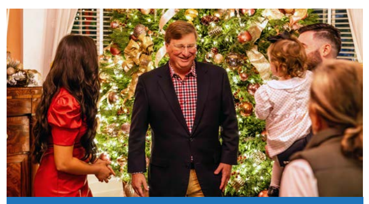
Gov. Tate Reeves greets guests at the Governor's Mansion during MDAH's annual Christmas By Candlelight Tour.