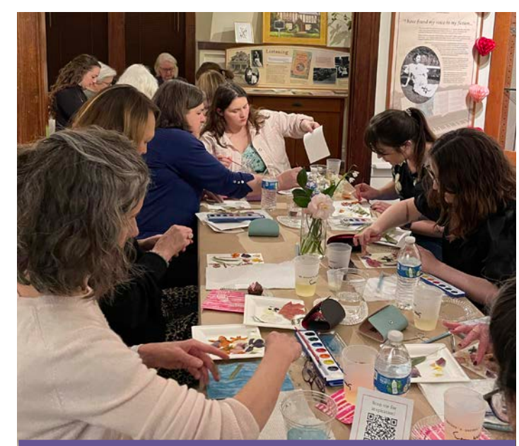
Participants create collages during a Pressed Flower Workshop at the Eudora Welty House & Garden.