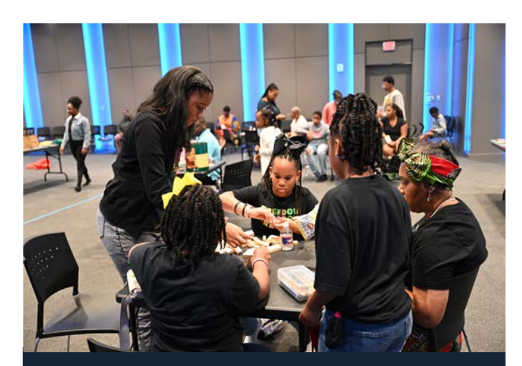
Families participate in Black History Month program activities at the Two Mississippi Museums.