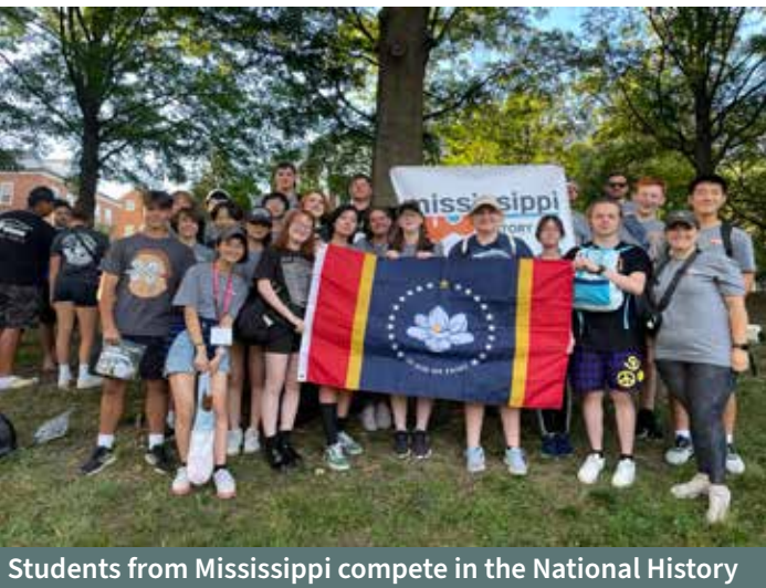
Students from Mississippi compete in the National History Day Competition held at the University of Maryland.