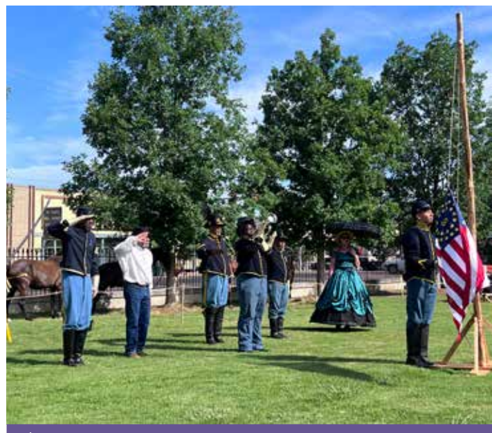
3<sup>rd</sup> US Colored Cavalry reenactors bring living history to the Old Capitol Museum Green.